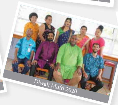
Diwali Mufti 2020