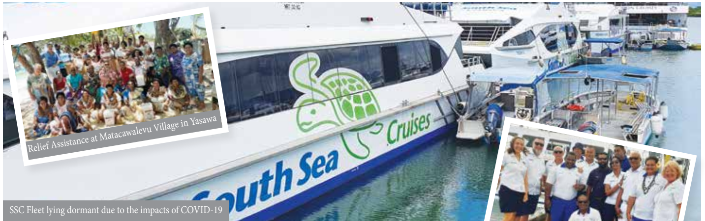
SSC Fleet lying dormant due to the impacts of COVID-19

Throughout the first half of FY21 South Sea Cruises including our subsidiary brands continued to be affected by the impacts of Covid-19. With international borders remaining closed, South Sea Cruises continued to suspend scheduled operations whilst the business operated with a skeleton staff who continue to undertake a range of essential business functions and responsibilities. As a result of these efforts the business continues to generate bookings for future travel and is in the best possible position operationally for scheduled daily operations to recommence without delay once borders reopen and it's again safe to do so.