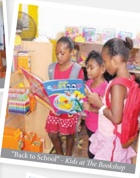
"Back to School" - Kids at The Bookshop