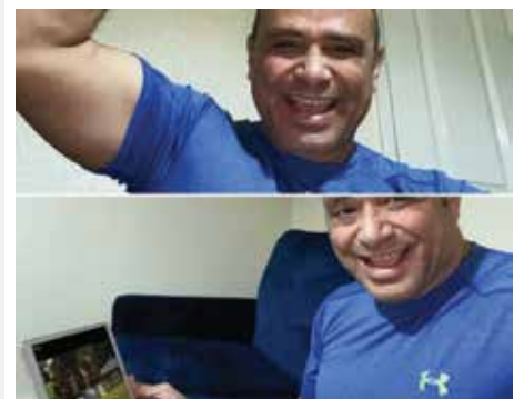
Celebrating Police's win over RFMF Ratu Sukuna Bowl by 32-8 was the Commissioner of Police Brigadier General Sitiveni Qiliho who was eagerly following every second and minute of the match in London via Livestream, thanks to Fiji One Television