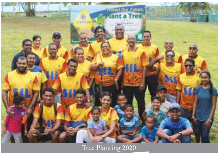
Tree Planting 2020