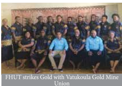
FHUT strikes Gold with Vatukoula Gold Mine Union

FHL Fund Management Limited (FHL FML), the fund manager for Fijian Holdings Unit Trust (FHUT) had declared a 3rd and 1st (FY21) interim dividend payout of $0.0145 and $0.0039 respectively. This was a slight decrease as compared to the same dividend payout period last year. However despite the economic uncertainties and the tough financial year experienced, the Fund Manager was still able to pay out competitive dividends to its investors.