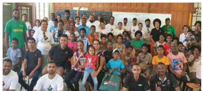
Merchant Finance assisting families in Naidovi Primary with food supply