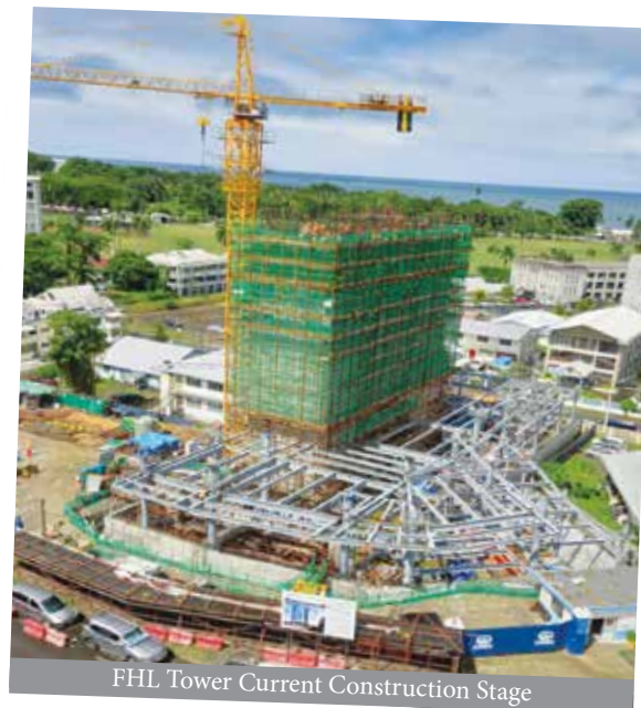
FHL Tower Current Construction Stage

We, however remain positive towards the progress of the FHL Tower and the occupancy of the remaining properties despite the projected economic outlook.