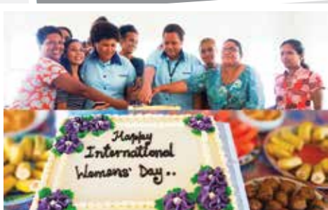
Celebrating International Women's Day 2021