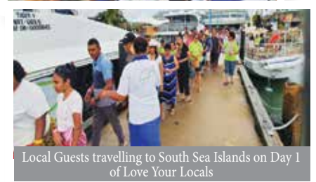
Local Guests travelling to South Sea Islands on Day 1 of Love Your Locals

The company also best supported staff and industry partners throughout the first half of the fiscal year given the continuing challenges faced by those staff without work. Staff and management came together in July, September, and December to deliver and receive updates on the company and industry and at the same time were provided with company issued shopping vouchers to best assist them and their families. The company through collaboration with industry partners in the Mamanuca's raised over $60k in donations from previous guests and customers. South Sea Cruises' portion of the funds was used to support our village and community partners in the remote Mamanuca and Yasawa Islands who rely so much on the tourism we generate for the region and don't