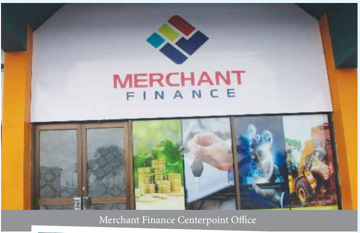
Merchant Finance Centerpoint Office

Our Western Team also hosted two days roadshow at the Gujurati Ground in Ba in partnership with car dealers in the Western Division, Asco Motors, Carpenters Motors, Niranjans, Nivis Motors, Pillay's Auto World & Bright Motors Limited, Shreedhar Motors, and Vision Motors.