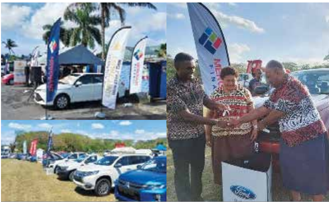
Centerpoint Roadshow with Fijian Holdings Unit Trust Ba Roadshow, where we release a brandnew Ford Ranger to one of our customers Ba

In October our west branches teamed up with Sigatoka Town Council and other stakeholders in Sigatoka for a cleanup campaign from Malevu village to National Trust, followed by tree planting at the Laselase river bank. After a very productive morning, the team visited 10 families from Naidovi Primary School in Sigatoka that were severely affected by Covid-19 and donated food supplies to assist them during this pandemic.