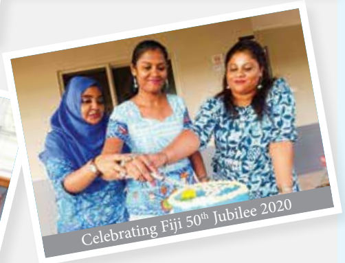
Celebrating Fiji 50 th Jubilee 2020