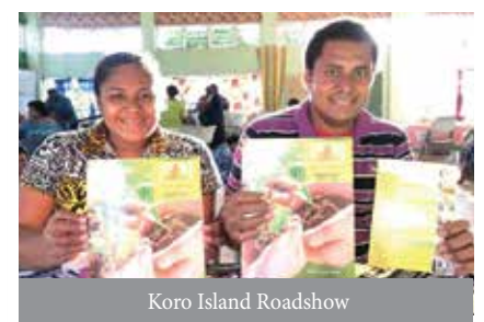
Koro Island Roadshow

In this same period, the management took few strategies that will help grow the fund in value and healthy return back to unit holders. One major focus was to grow our Employment Deduction Scheme (EDS) client base. The fund saw the signing of new companies to join our Employment Deduction Scheme (EDS) product and one notable union was the Vatukoula Gold Mine Union whereby more than 700 workers had signed up for it. Moreover, Fijian Broadcasting Corporation