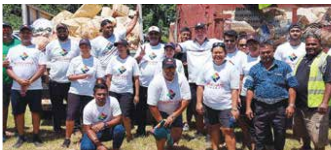
Merchant Finance Staff picking rubbish in Sigatoka with Sigatoka Town Council Staff

Our North Branches – Labasa, Savusavu & Taveuni in partnership with Drive Smart conducted a blood drive at the Drive Smart yard in Labasa and collected 15 pints of blood for Labasa hospital.