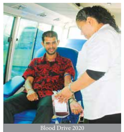
Blood Drive 2020