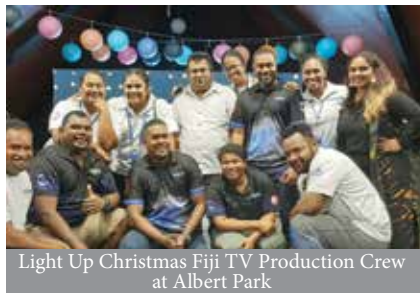
Light Up Christmas Fiji TV Production Crew at Albert Park

We are looking forward to a more fruitful and prosperous new year.